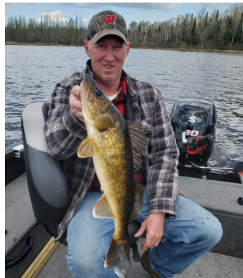
Puck, master angler.