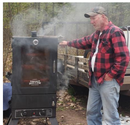
Puck, master smoker.