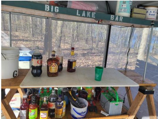
GWA bar will be stocked and ready.

Boulder Junction, WI Coming on the heels of President Trump announcing that April 12 th would be Liberation Day for the United States once his tariffs took effect, GWA headquarters announced that Wednesday, May 14 th would be Libation Day at GWA-2025.