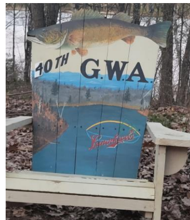
The chair of honor awaits!